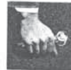
The Emergency Escape Handle