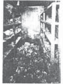
Records inside the vault "protected" with uninsulated plate type door, with inner door reduced to ashes.