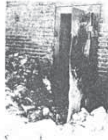
Uninsulated plate type vault door, with inner doors, warped and twisted out of shape in actual fire.